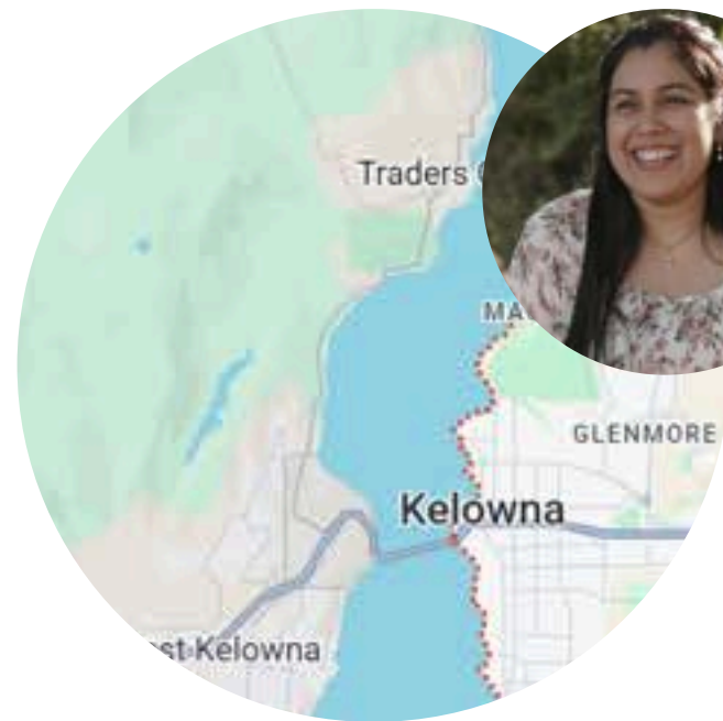
KELOWNA OPENED WINTER 2024