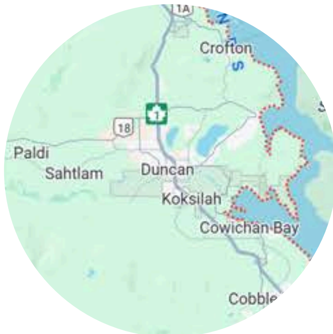
COWICHAN VALLEY OPENED SUMMER 2024